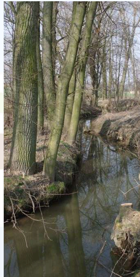
Koprzywianka River Poland