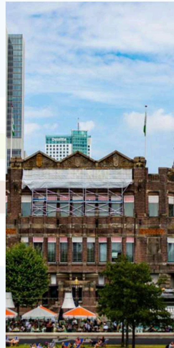
Rotterdam Urban Area The Netherlands