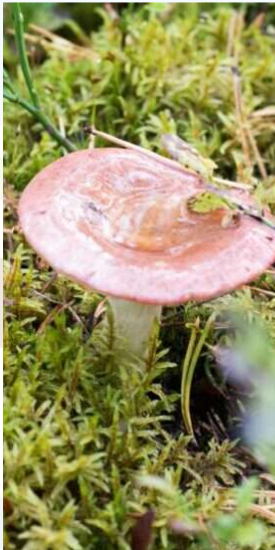
Airport in Örnsköldsvik Sweden