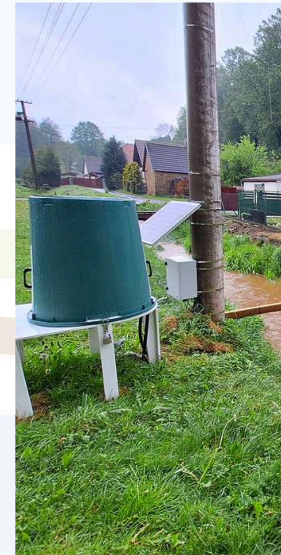
Zelivka River Basin Czech Republic